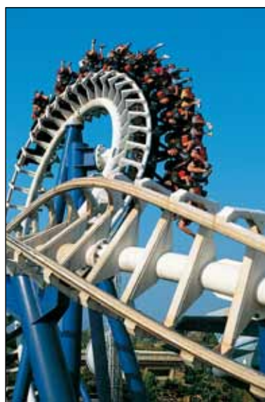
Gardaland roller coaster.

Cappeller Animal Park and Zoo: in Cartigliano, Via Kimle, 28 miles north of Vicenza. April- September, 9 a.m.–7 p.m.; Sunday 9 a.m.–8:30 p.m. Botanical gardens, picnic areas, playground